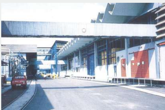
GUINNESS ANCHOR BERHAD