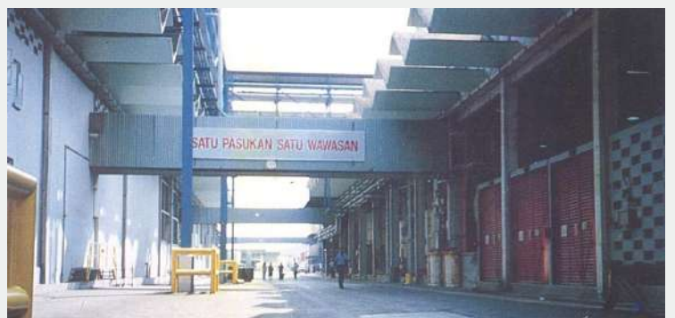
GUINNESS ANCHOR BERHAD