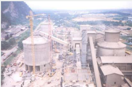
ASSOCIATED PAN MALAYSIA CEMENT