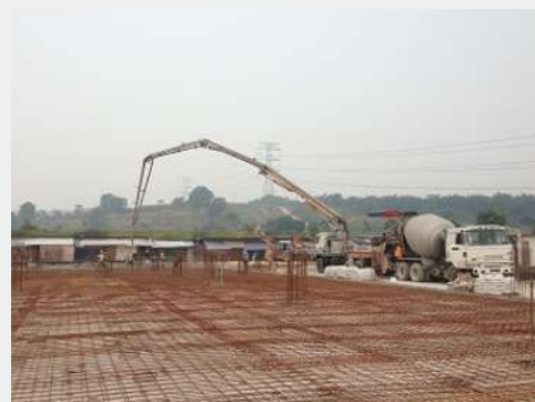
Concreting ground floor slab