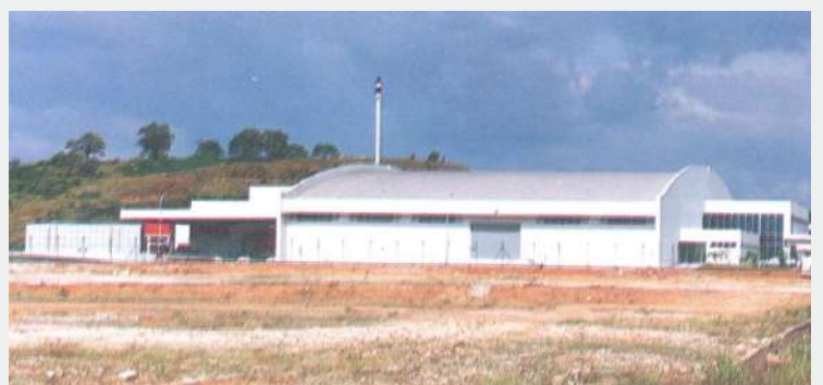
ASSOCIATED PAN MALAYSIA CEMENT