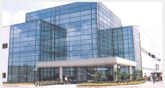
NIPPON ELEC (M) SDN BHD