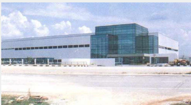
NIPPON ELEC (M) SDN BHD