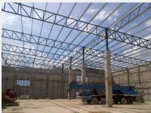
Steel Truss Installation