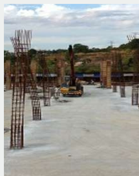
Completion of ground floor slab